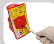
BladeFLASK Blade Remover