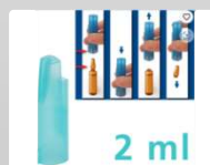
inplusDESIGN Ampule Opener