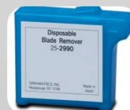
Disposable Blade Remover