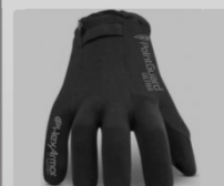
PointGuard® Ultra 6044

Needlestick, cut, puncture, and abrasion resistant gloves.