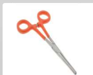
Soldering Straight Gripper