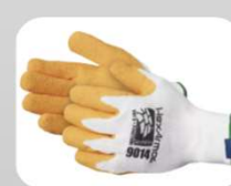
SharpsMaster® II 9014