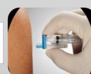
VanishPoint Retractable® Needle