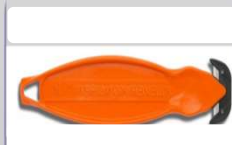
Disposable Safety Cutters