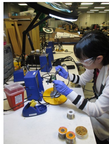
Designated soldering area with fume extractors at each station

Please contact EH&S at 206.543.7388 for more information about lead safety.