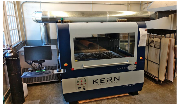
UW Mechanical Engineering laser

The purchase of a laser cutter/engraver requires prior approval from Environmental Health and Safety (EH&S).