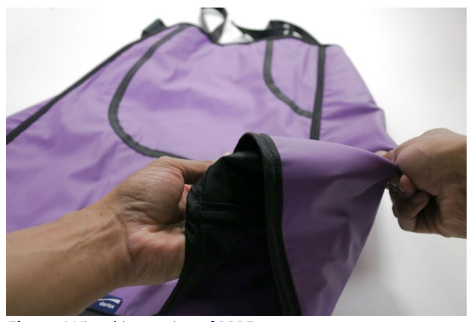
Figure 1 Visual inspection of RPPE