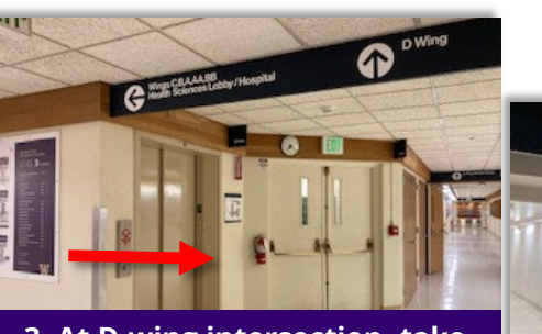
3. At D-wing intersection, take the stairs/elevator to 2<sup>nd</sup> Fl

2. Go through the lobby and head down the corridor to your right