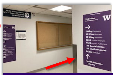
5b. Turn right at the end toward the library

4. On 2<sup>nd</sup> Fl, follow signs to Twing & library