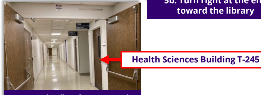
6. Pass the fire doors; T245 is to your right